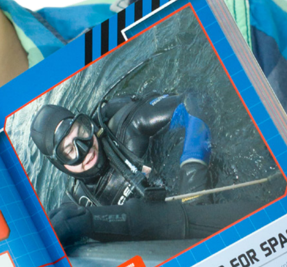
A diver wears a neoprene wetsuit to stay warm in the water.

Neoprene is loaded with tiny nitrogen gas bubbles. The bubbles help stop heat from leaving your body, making neoprene a good insulator. Neoprene is also physically tough. It resists tearing from flexing and twisting. Neoprene is a great material to have if you move like a super hero.